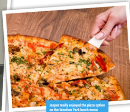
Jasper really enjoyed the pizza option on the Wootton Park lunch menu

Every day, you can buy food before school, at lunch or at break. I enjoyed the Belgian Waffle and Pizza. To clarify, the school is aware of different allergies, so you just need to let them know. Daily, there is a new special at lunch that you can purchase from the Snack Shack or the canteen. There is also a FREE salad bar where I regularly collect a suitable amount of carrot slices and chopped peppers. YUM!